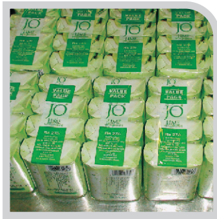
Banded Soaps with perfect eye-mark registration